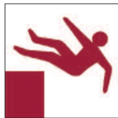
Disgynfeydd peryglus Unprotected drops