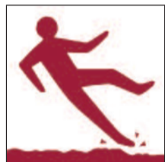
Lloriau anwastad neu lithrig Uneven or slippery surfaces