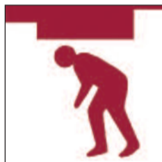
Toeau isel Low headroom