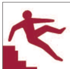
Grisiau anwastad, serth a chul Uneven, steep or narrow stairs

Ceir rhai o'r arwyddion rhybudd canlynol, neu bob un ohonynt, ar y safle hwn. Some or all of the following warning signs can be found situated around the site.